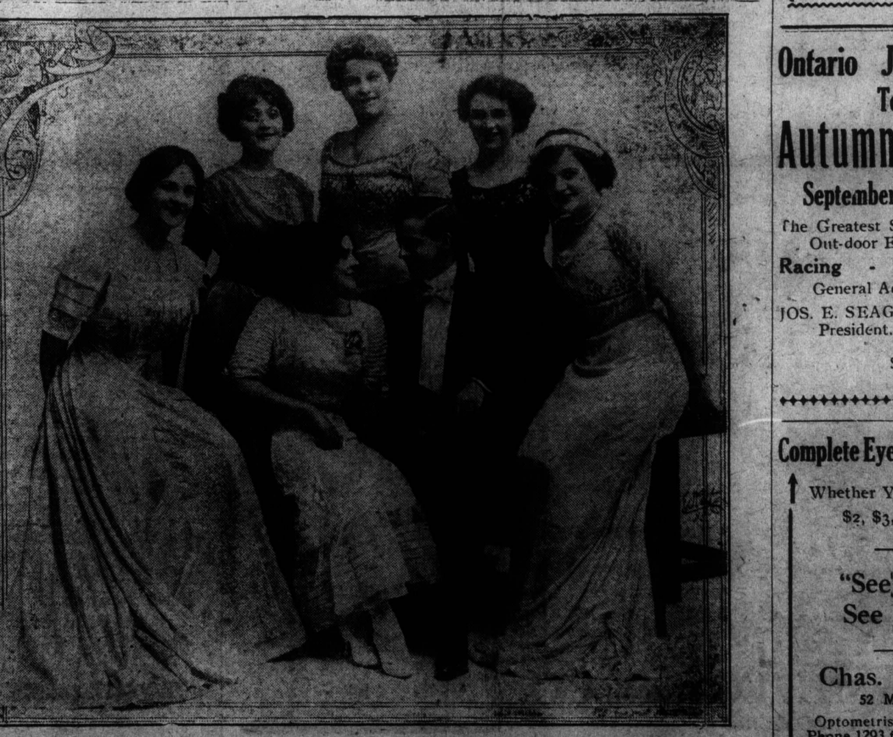
Scene from Brewster's Millions which will be presented at the Grand next Saturday.