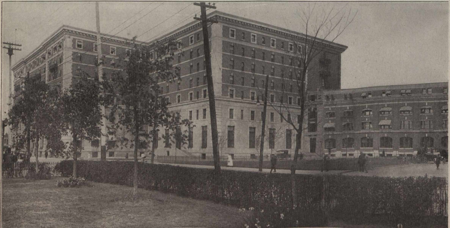
Canadian Pacific Railway Hotel and Part of General Offices, Winnipeg, from the South.

A large second class waiting room is conveniently located on the west, or left hand side, of the midway. On this side are also rooms for Station Master, Dispatcher, conductors, trainmen, Advertising Agent, C.P.R. police, and the caretaker. Ventilation in these rooms is provided by motor driven supply and exhaust fans, with the necessary distributing ducts, and provides