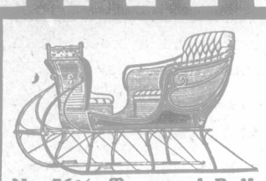
No. 761/2—Tecumseh Belle No effort has been spared to make this the most popular and comfortable sleigh on the market. This cutter is one of our best styles and is to be strongly recommended to our patrons. It is built low down and strongly braced and is equipped with an especially high back with a deep and wide seat and high sides. It has channel shoes and nickle arm rails and line mil.

The Kenora Beauty is a fine, commodious, covered sleigh with plenty of leg room in front. Built with high side panels and an especially high back, it is painted in black, walnut or mahogany with the gear in carmine or green. It is constructed on its merits in every particular.