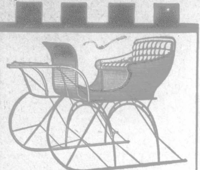
No. 34—Winnipeg Special

This is a gentleman's road sleigh, is built strong, natty and roomy and allows the horse to be hitched close without striking and runs level over crossings and rough, uneven grounds. Painted body black and gearing carmine or green—cloth trimming. It is a spleadid sleigh for speeding.