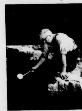
Our own iron-free water

AT THE JACK DANIEL DISTILLERY, we have everything we need to make our whiskey uncommonly smooth.