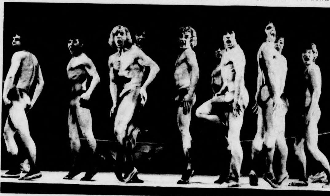
Henryk Tomaszewski's spectacular Polish Mime Ballet Theatre Company comes to York next Wednesday for a sold-out evening performance. Acclaimed as the most original choreographer Eastern Europe has

Thursday, 12 noon — (Division of Language Studies) "Cuba: Art and Revolution" a documentary (English) dealing with the emphasis that Fidel Castro's government has placed on the development of the fine arts — N203, Ross. 7:30 p.m. — (Legal & Literary Society) "Fortune in Men's Eyes" — admission $1.00 — Moot Court Room, Osgoode. 8:30 p.m. — Play (York Masquers) "The Bacchae" (by Euripides) will be performed March 1, 2, 3, and 4; tickets are on sale in Central Square and cost $1.50; tickets at the