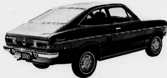
THE INFLATION BEATER: DATSUN 1200 FASTBACK — $2,363 Complete

Can a man be quoted who talks over a friendly glass at a party? "Go ahead," replied Ferguson. "Never in my life have I endorsed a commercial product for money but, I'm prepared to stand behind my Datsun for free."