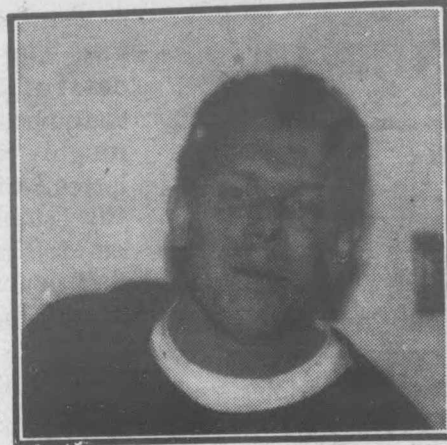
Caveman 1 of 4 "Dark and Deep"