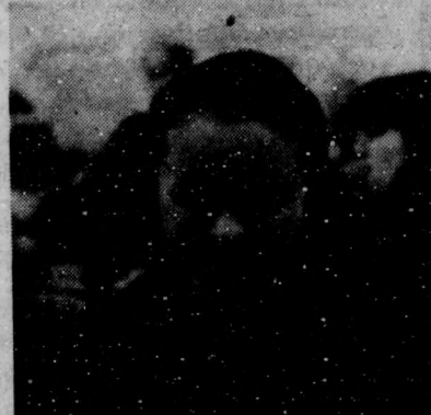
Eileen Larken "Don't heat the rooms so much."

OPENING DOOR AL OPENING DOOR AL OPENING DOOR AL OPENING DOOR AL