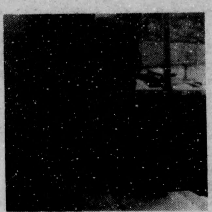
Moria Espejo "Campus security -