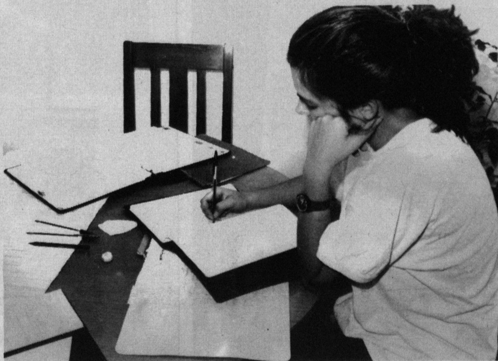
4:30 pm — She's back home and doing some homework before she entertains some friends at home tonight...