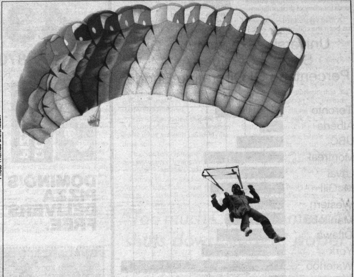
U of A skydiving club - the only way to get campus parking!

Potentially forty five percent of the money raised could go to the