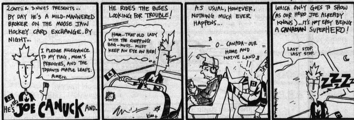
(FOR A FRENCH VERSION OF JOE CANUCK SEND S.A.B. TO B.P. 11172 CHICOUTIMI, QUE. TO BE CONTINUED..)