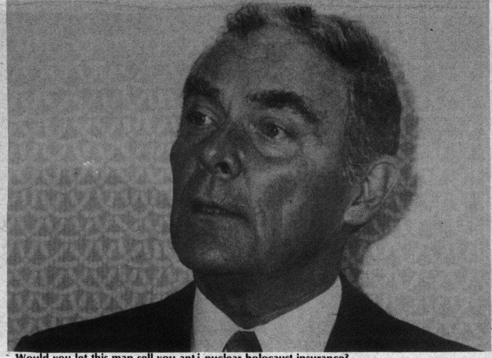
Would you let this man sell you ant i-nuclear holocaust insurance?