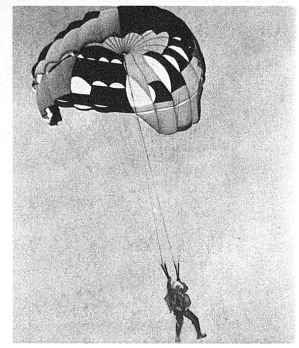
WHAT GOES UP MUST COME DOWN