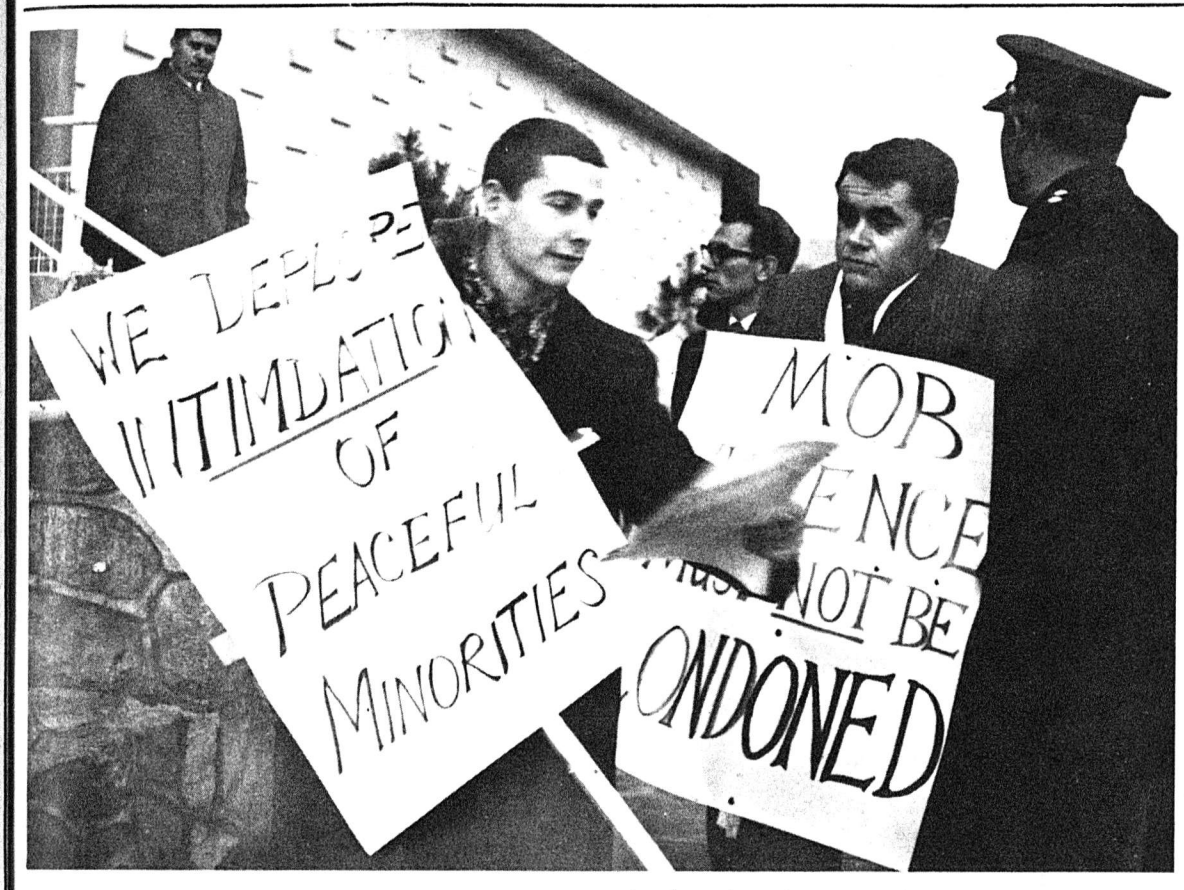
STILL FIGHTING CITY HALL—Accepting the fact that three people can constitute an unlawful assembly, only these two demonstrated at City Hall on Tuesday afternoon. More police than people showed up.