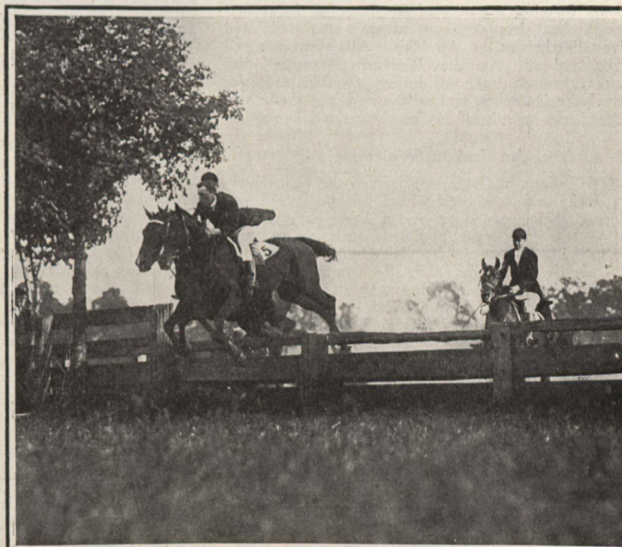
There were four Steeplechase Races for Members, and one Flat Race for Farmers.