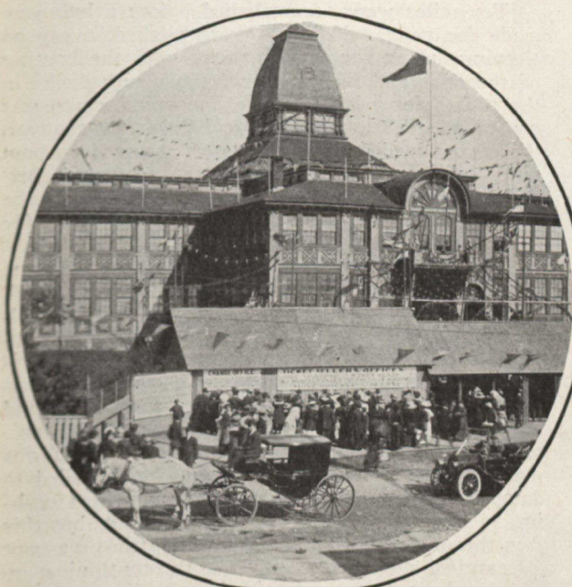
Exterior of the Main Building and the General Public Entrance.

and patriotic feeling. A nation is created and welded together by many different circumstances and feelings and it may be that Dominion Exhibitions as such may be sufficiently influential to justify the Government's annual expenditure of $50,000. However, the Government may have other ideas equally good under consideration, and upon them rests the responsibility of ending or continuing what has been a good policy.