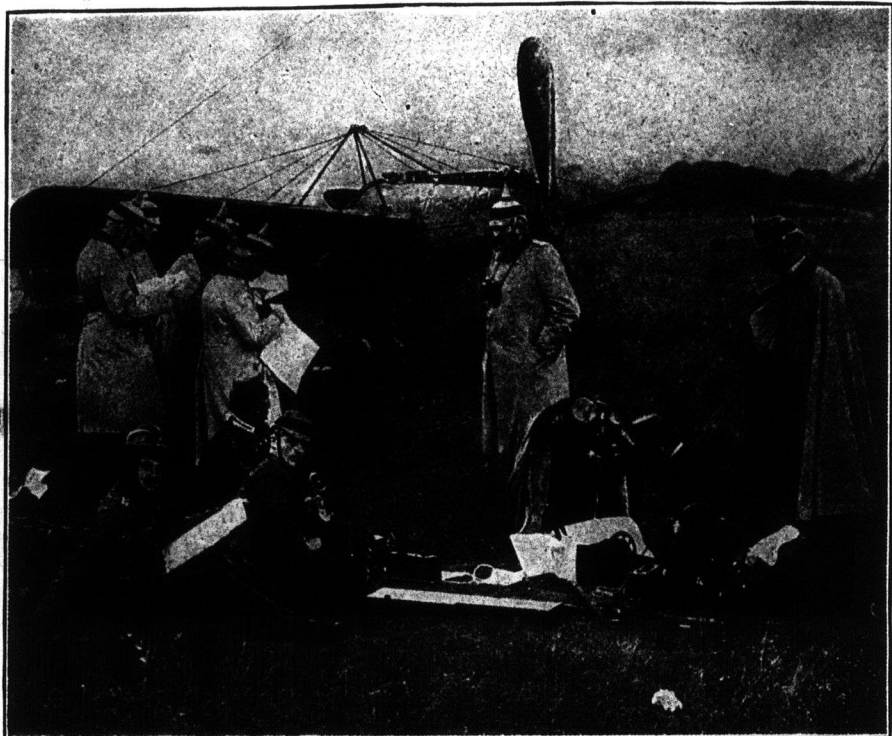
Officers of the German Staff considering messages brought by aeroplane scouts which resulted in the Germans being obliged to retreat.