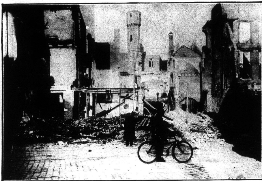
Germans in Antwerp. The Germans did not treat Antwerp as badly as they did Louvain but on the slightest excuse would sacrifice life and property.