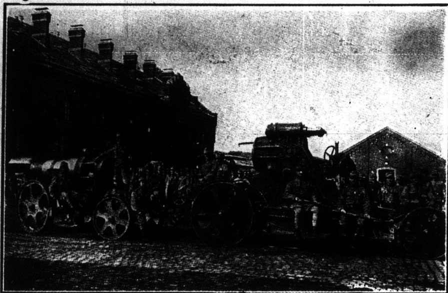
One of the 100-ton German Siege Guns.