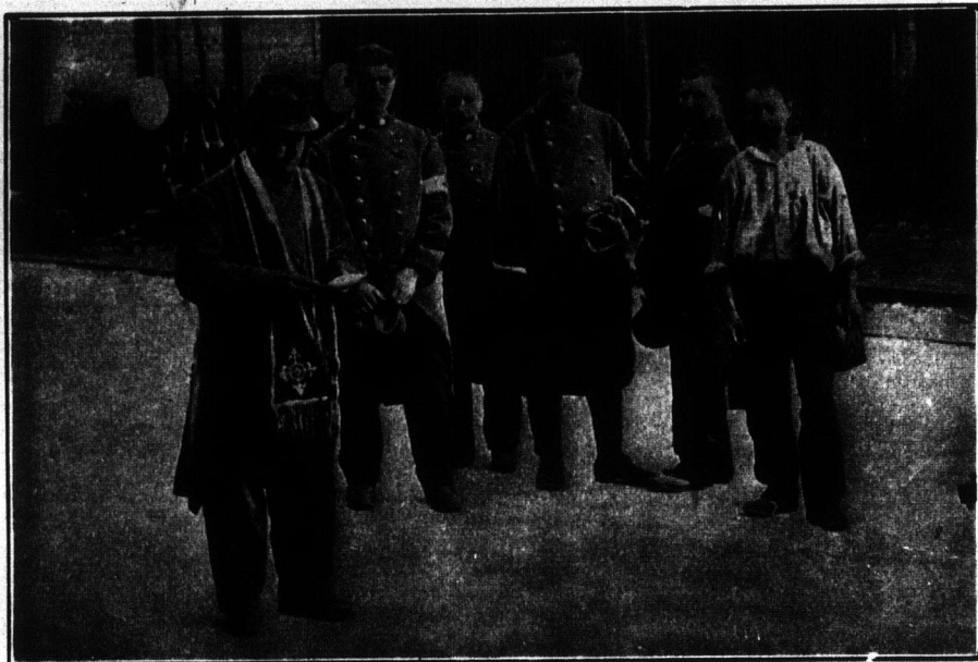
Wearing his stole over his military uniform. A French priest on active service conducting a comrade's funeral.