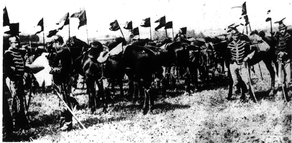
Belgian Standards tattered by German Shells.