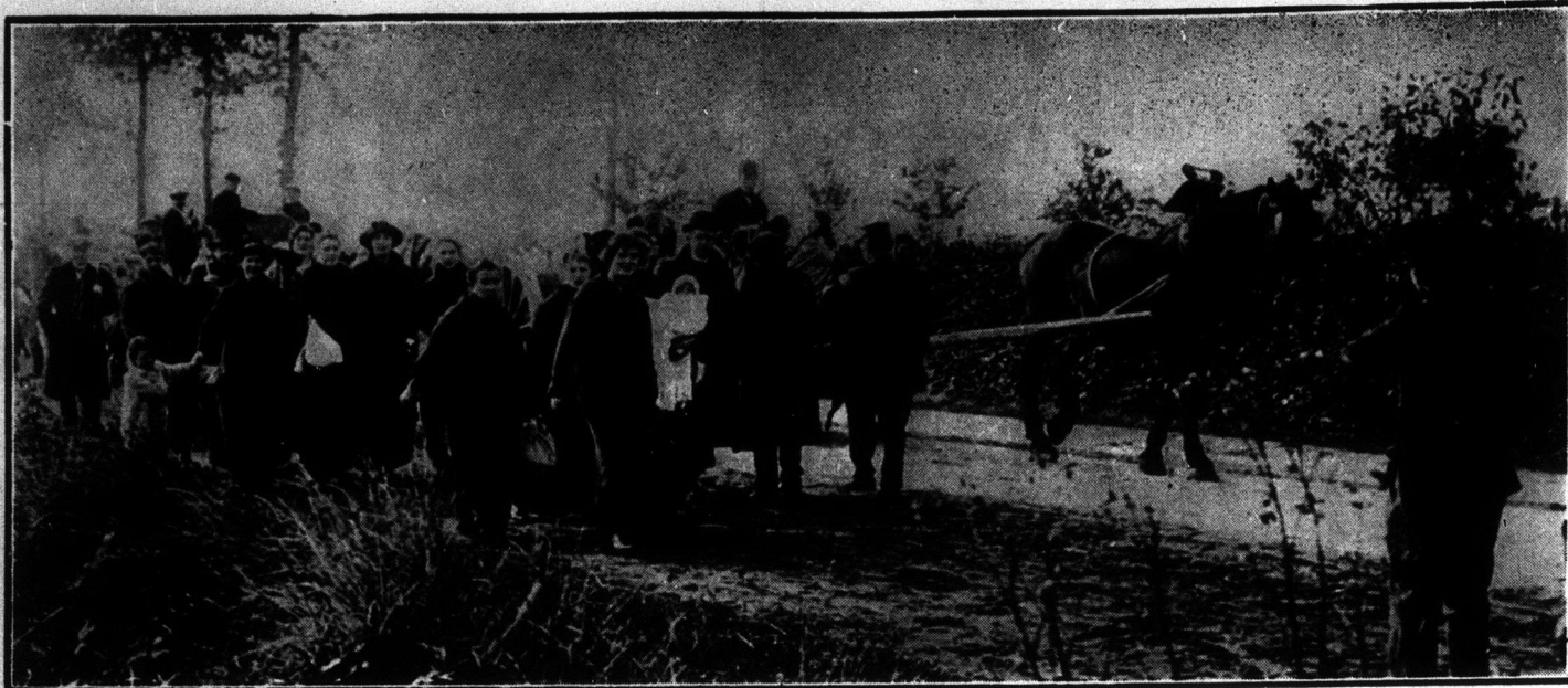
The exodus of refugees from Antwerp passing through Rosendaal in Holland.