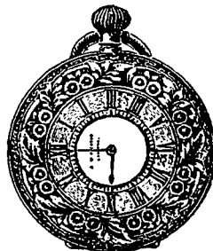
MISSSES' SILVER WATCH, Value $12.

REMIT by Post Office or Express Money Order, Registered Letter, or New York Draft, and address, THE CANADIAN QUEEN, Toronto, Canada.