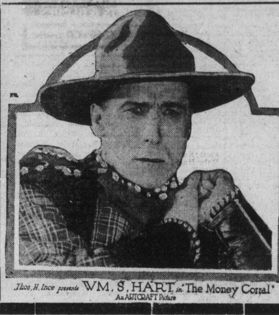
W.M. S. HART, in 'The Money Corral'