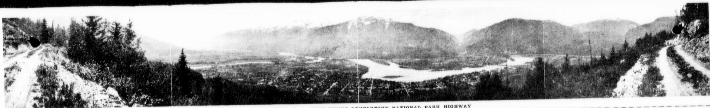
REVELSTOKE, B. C. FROM MOUNT REVELSTOKE NATIONAL PARK HIGHWAY