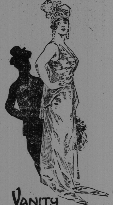
VANITY IN HENRY W. SAVAGE'S ELABORATE MUSICAL SPECTACLE EVERYWOMAN

Corner Union and Docks Sts. St. John, N. B.