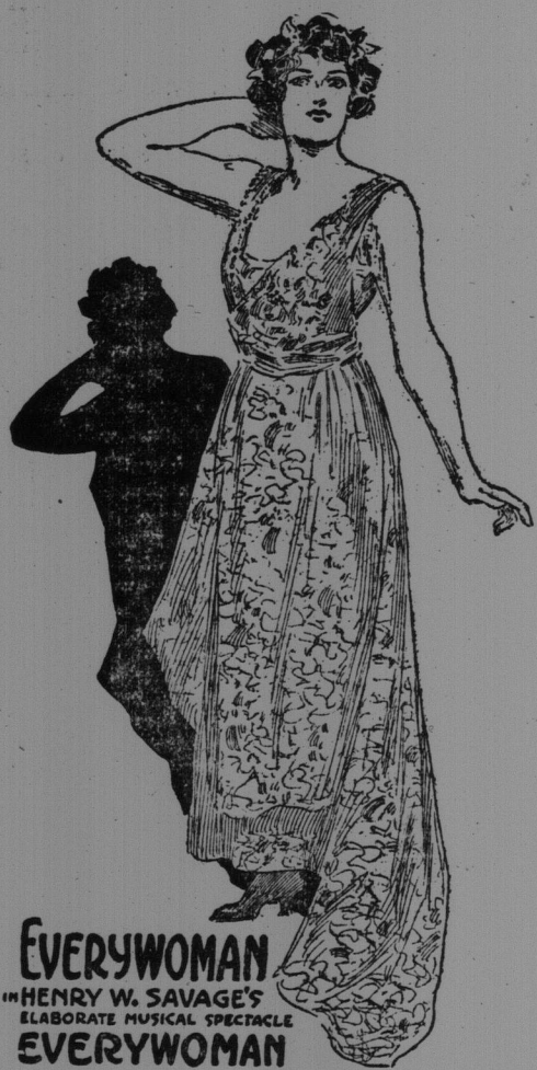
EVERYWOMAN IN HENRY W. SAVAGE'S ELABORATE MUSICAL SPECTACLE EVERYWOMAN