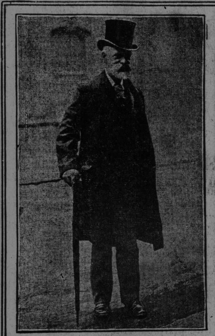
AMBASSADOR JAMES BRYCE.

Royal His Staying Place—Drive, Canadian Club Luncheon, Entertainment By Premier Hazen Features of Programme Arranged.