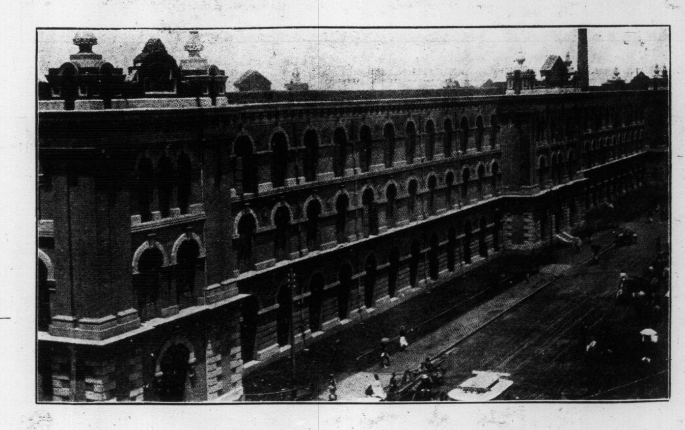
PORT COMMISSIONERS' TEA WAREHOUSE, CALCUTTA.