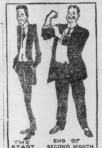
Protone Will Make You Nice and Plump.

It is astonishing to see the effects produced by the new flesh-increaser Protone. Input on fat, and the gain in weight of a pound a day, is not at all remarkable with this new wonder.