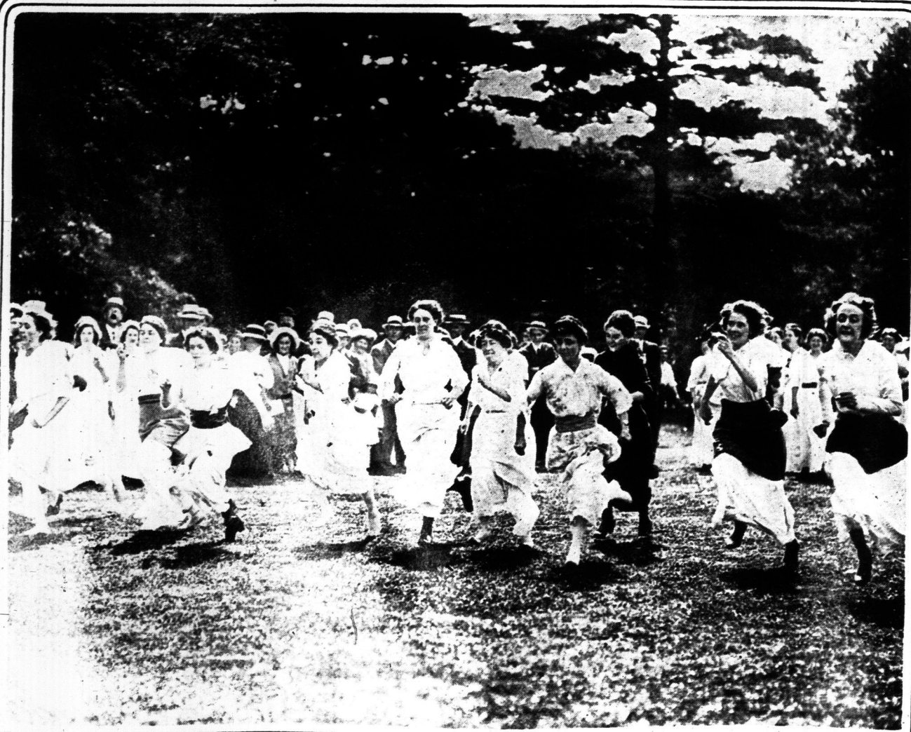
THE RACE FOR WOMEN MARRIED LESS THAN TEN YEARS WAS THE FEATURE EVENT OF THE CONSERVATIVE PICNIC.