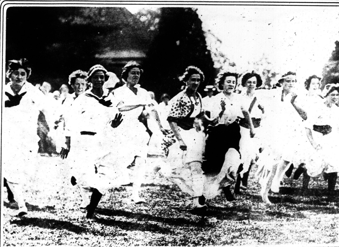
THE GIRLS OVER 16 YEARS RAN A REAL RACE AT THE CONSERVATIVE PICNIC AT QUEENSTON HEIGHTS. THE PICTURE SHOWS THEM AT THE START.