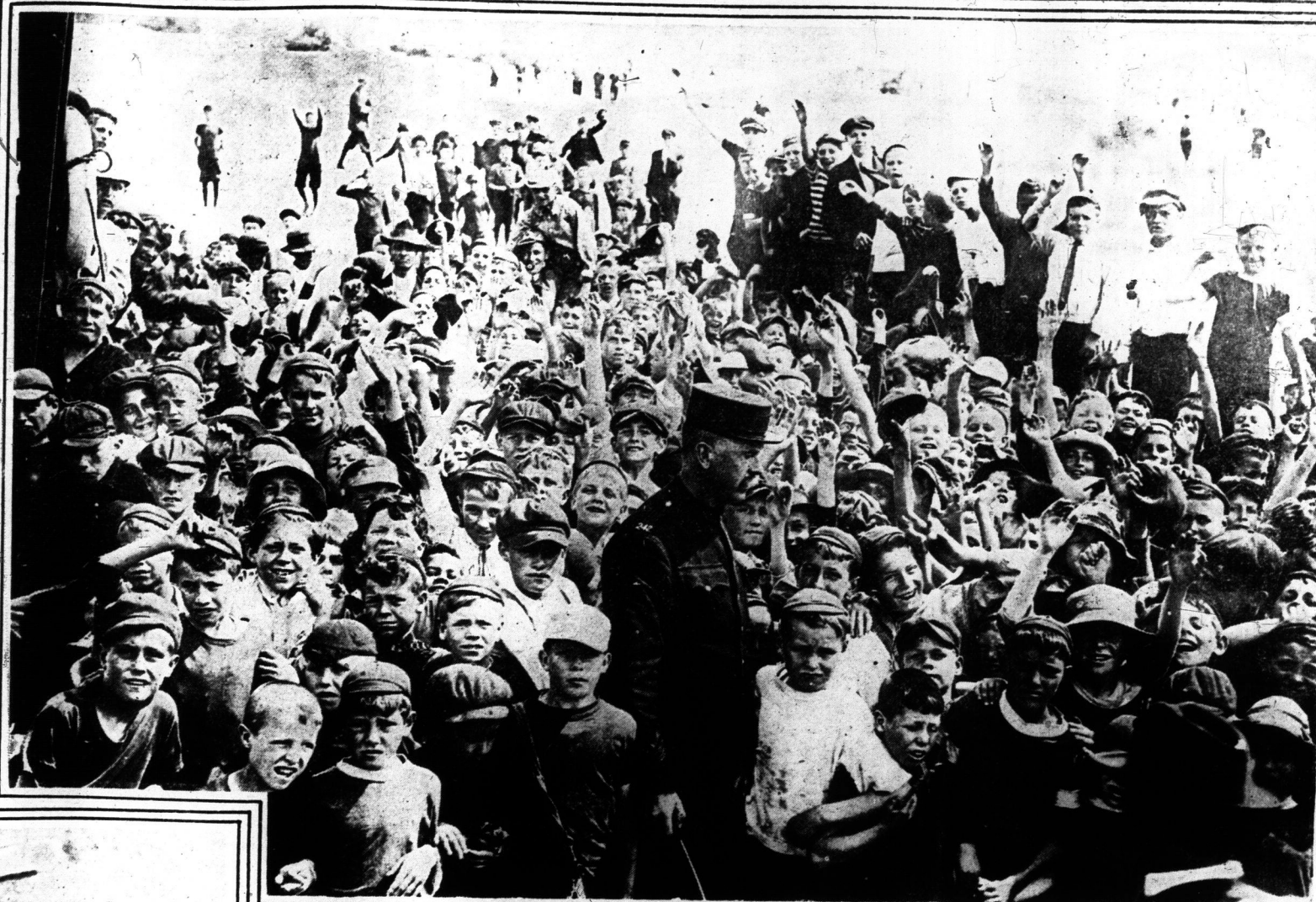
ALL HAPPY EXCEPT THOSE WITHIN REACH OF THE OFFICER'S WHIP. CITY YOUNGSTERS TAKEN AT THE FREE BATHING STATION AT FISHERMAN'S ISLAND.