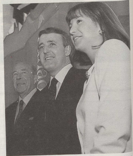
US Secretary of State George Shultz (left) with Mr. and Mrs. Mulroney, in Washington.

The prime minister said that he welcomed