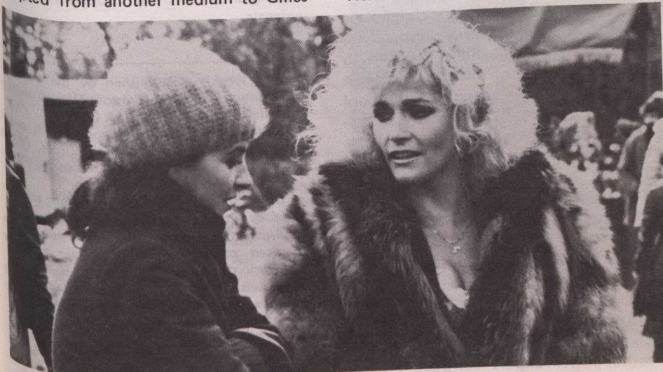
Annie Potts (left) and Margot Kidder in the film Heartaches .