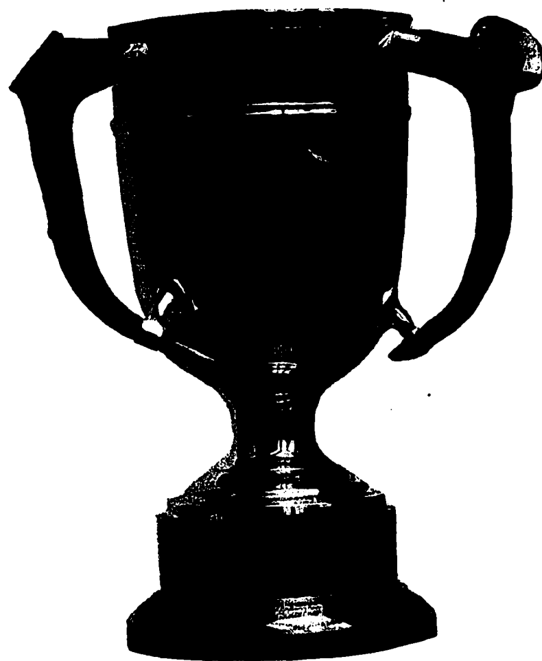
"DE LUXE" MAGAZINE CHALLENGE CUP

A Perpetual Trophy To be Competed for by the