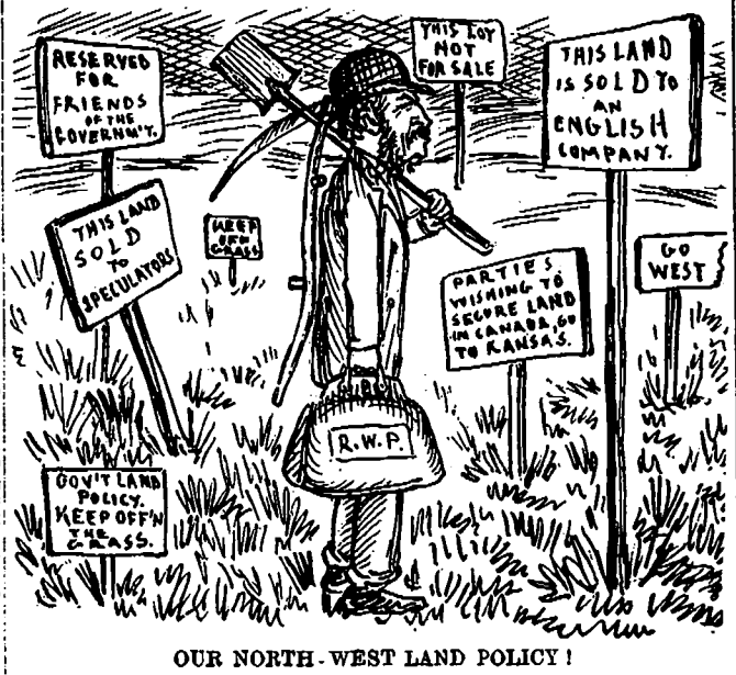
OUR NORTH-WEST LAND POLICY!

"The very dimples of his chin and cheek, His smile, the very mould and frame of hand And nail, and finger."