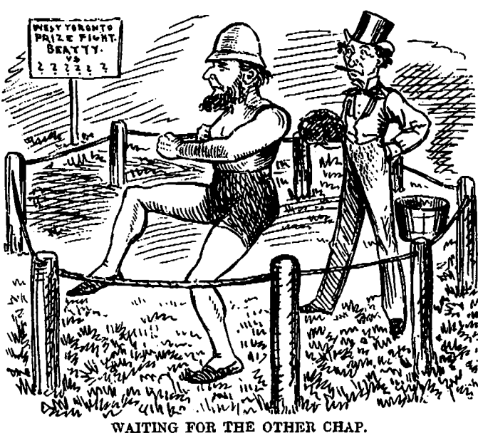
WAITING FOR THE OTHER CHAP.

JACOB'S PATENT LITHOGRAM. — GREAT REDUCTION IN PRICES. — Postal Card Size, $1.00. Note Size, $2.00. Letter Size, $3.00. One Bottle of Ink with each Lithogram. AGENTS WANTED IN EVERY TOWN. NEXT POST OFFICE, TORONTO. BENGOUGH BROS., AGENTS.