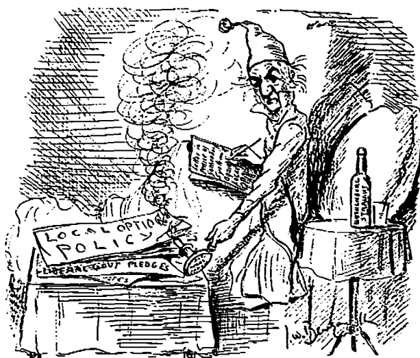
GLADSTONE HAS "RETIRED,"

But he still manages to do a good deal of mischief by making a public declaration against the policy of Local Option to which the Liberal Government is committed.