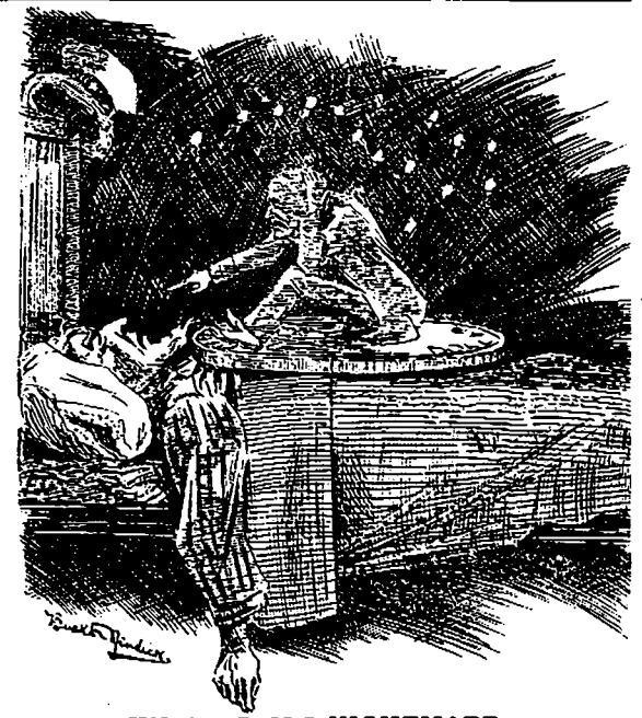
UNCLE SAM'S NIGHTMARE

When a Man gets what he Wants he's sure to Kick; it's the Way of the Cuss.