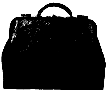
Deep Club Bag Style No. 921, $10.00 18 inches, OLIVE LEATHER. From our Illustrated Catalogue No. 6.