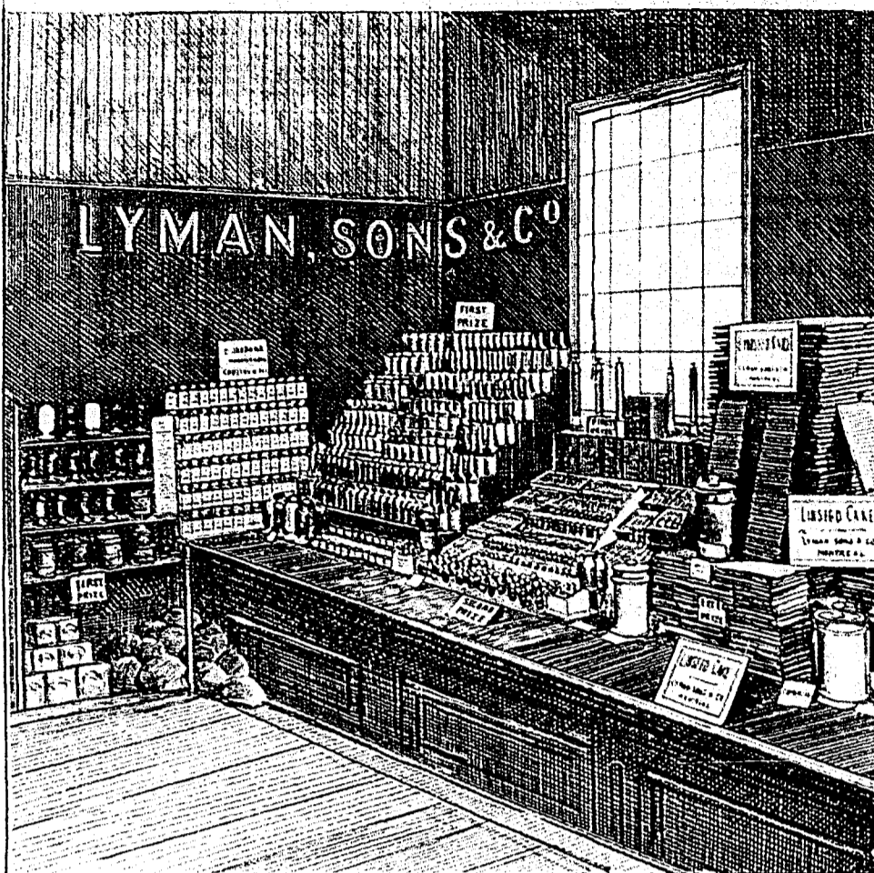
THE EXHIBIT OF LYMAN SONS & CO., MONTREAL, AT THE DOMINION EXHIBITION, OTTAWA.

PAINTERS' & ARTISTS' MATERIALS, BRUSHES CHEMICALS, DYE STUFFS, NAVAL STORES, &c. 340, 312, 314 & 316 ST. PAUL ST., AND 255 & 257 COMMISSIONERS ST. MONTREAL. 26-17-52-309