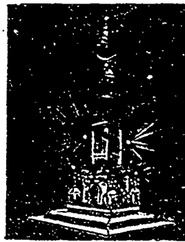
Light from all quarters.

who says: "That in view of the invincible array of evidence therein it would seem a thousand times harder not to believe in the Bible." All skeptics are vanquished by glaring evidence. No book ever sold so fast. 400 AGENTS WANTED. Prospectus free. Get particulars immediately. Don't miss opportunity to secure Territory. Address,