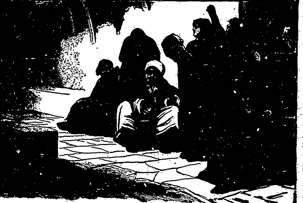
MOURNESS IN THE MARY AT A FUNRAL.