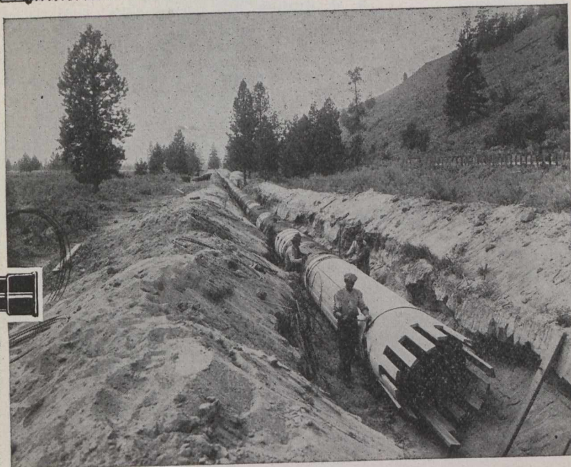
48 in. CONTINUOUS STAVE LINE.

Manufacturer of Galvanized Wire Machine Banded WOOD STAVE PIPE CONTINUOUS STAVE PIPE RESERVOIR TANKS