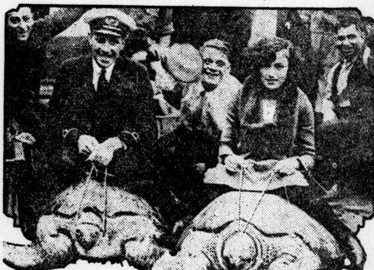
Who Says Turtle Soup?