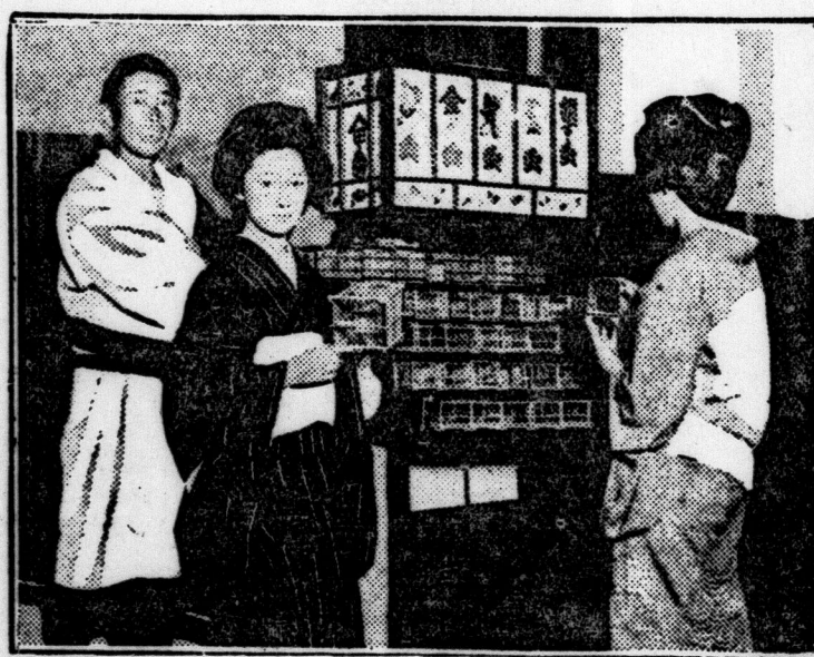
Some Real Geisha Girls.

HERE'S some of the real thing. Japanese geisha girl beauties. They've prepared bamboo cages filled with small singing birds for a Tokio festival. These girls are hired out by their guardians to anyone desiring entertainers for social events. By a recent order of the Japanese government these girls are now to enjoy freedom from the strict confinement which has been the custom in the past.