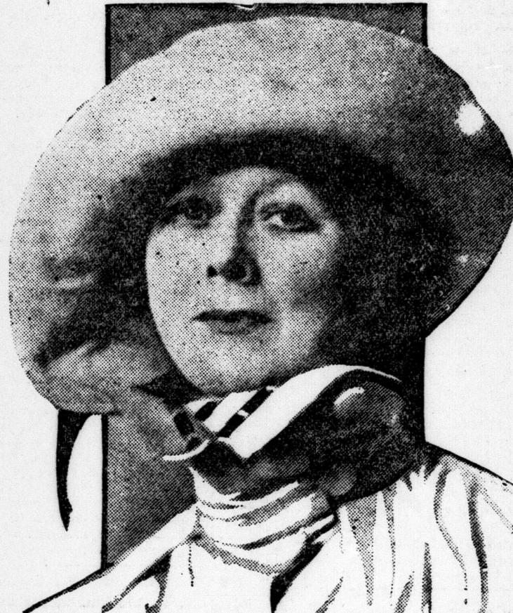
High Priestess of Dancing.

ISADORA DUNCAN, the famous exponent of a school of dancing all her own, declared on her arrival at Ellis Island that she thought art much better than cash. Miss Duncan (whose married name is Mrs. Serge Yessenin), praised the freedom of the Russian people. She indignantly refuted the allegations that she was a Bolshevik when confronted with the rumor by U. S. immigration authorities, declaring that she was only a Bolshevik to the extent that she loved freedom.