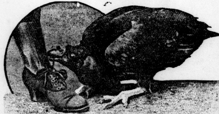
Connoisseur in Shoelaces.

THIS king vulture at the London, England, zoo, unties the shoelaces of every visitor who gets within his range. He loves to peck and pull at silk stockings, though he never tears them.