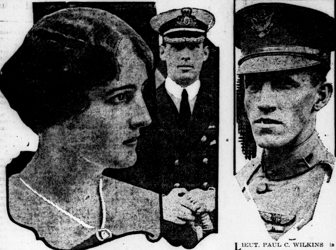
New King and Queen of Greece.

AFTER many disappointments and setbacks, George, Duke of Sparta, and eldest son of the former King Constantine, rules over Greece. The new monarch is 32 years old, and his bride, Princess Elizabeth of Rumania, whom he married in 1921, is 28.