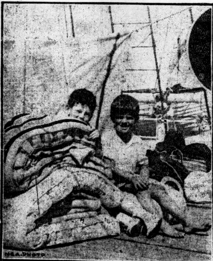
All That Is Left of a Happy Family.

THEY saved their bedding, but could not save their parents. Two poor little refugees who were found wondering about the Smyrna victims of Turkish ruthlessness, were taken on board the hospital ship Maine, which carried them to the sheltering haven of the British colony at Malta.