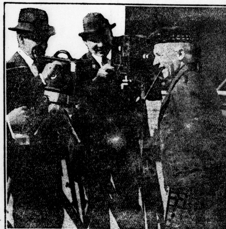
Sir Harry "Stauns for His Pictor."

THE famous Scotch comedian, Sir Harry Lauder, kilts, pipe and a', poses for the motion picture cameramen when he arrived recently in New York, for what he says is a farewell tour of the United States.