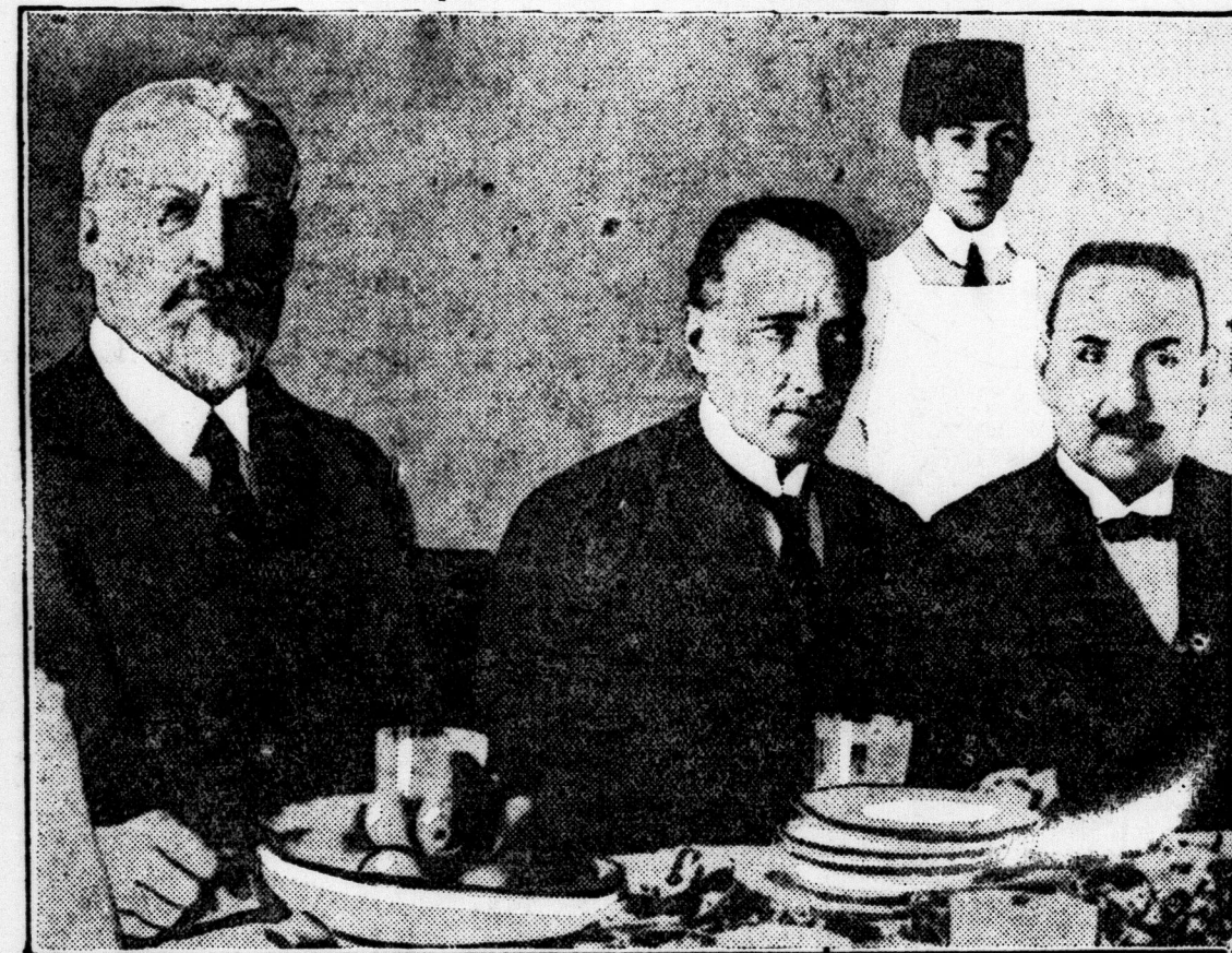
Mustapha Kemal Pasha Celebrates Armistice.