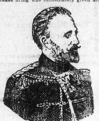
GRAND DUKE NICHOLAS NICHOLAEVITCH.

Grand Duke Nicholas was personally reviewing manoeuvres and putting the troops through blank firing practice when he was suddenly startled by the wasplike hiss of bullets about his head. Fortunately neither himself nor his horse was touched. The command to cease firing was immediately given and