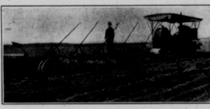
60-H.P. HOLT CATERPILLAR GAS TRACTOR breaking at Namaka Farm, Namaka, Alberta, Canada. Pulling 10 14-inch engine gang and packer.