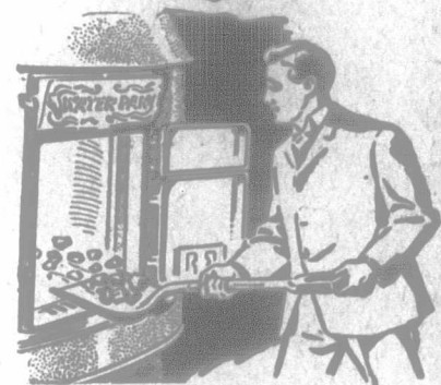
Big Double Feed Doors