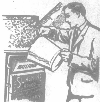
Filling Water Pan