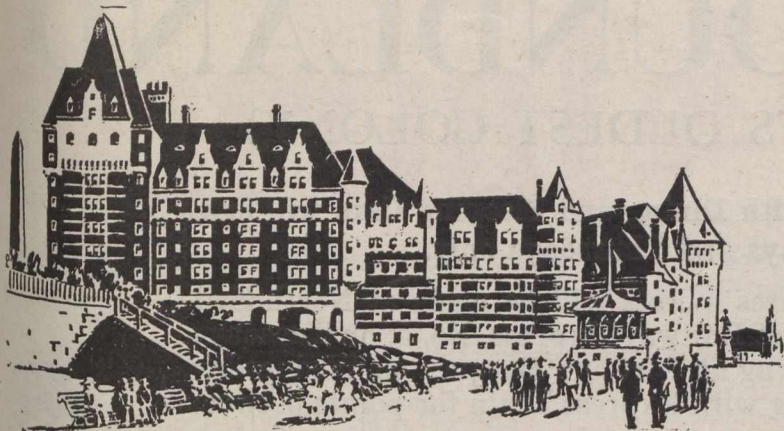
CHATEAU FRONTENAC, QUEBEC.