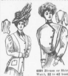
6091 Blouse or Shirt Waist, 32 to 42 bust.

Patterns 10 cents each. Order by number and size. 17 for children, 8 give age; for adults, give bust measure for waists, and waist measure for skirts. Address all orders to Pattern Department.