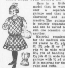
Material required for the medium size (10 years) is 3 1/2 yds 27, 3/4 yds 32 or 1 yds 44 in wide with 1 1/2 yds of banding; 1 1/2 yds 36 in wide for gumps with 1/2 yd of 18 in material for the robe and cuffs.

The patterns for girls of 6, 8, 10 and 12 years will be mailed on receipt of ten cents.