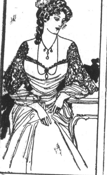
PICTURESQUE EVENING GOWN.

Some of the prettiest hats are very simple, and, despite all efforts to the contrary, they are very flat, but this