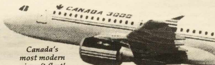
Canada's most modern aircraft fleet!