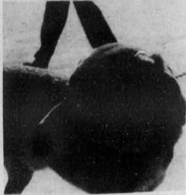
Blue Law 3 Snoopy