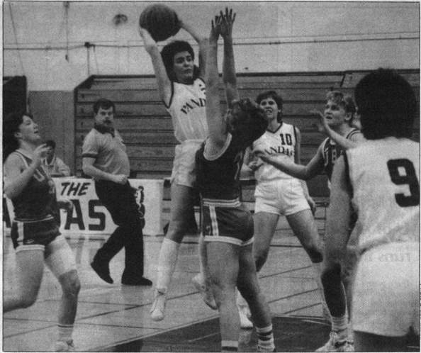
The Pandas easily defeated Grande Prairie twice last weekend. They take on their alumni Friday.

FREE THROWS: The Pandas start their home schedule against their alumni on Friday, before they go to tournaments in Calgary and Toronto. Their first conference game goes in Saskatchewan on November 13.