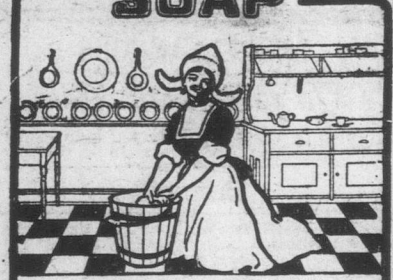
HALF THE TOIL

of household work is taken away when Sunlight Soap is brought into the home. For thoroughly cleansing floors, metal-work, walls and woodwork, Sunlight is the most economical both in time and money.