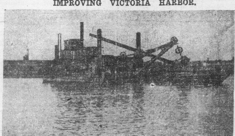
Dredge Mudlark at work in Upper Harbor.

was found and that was in the neigh-lits formulation by representative con borhood of Turpel's ways. It has over vention,