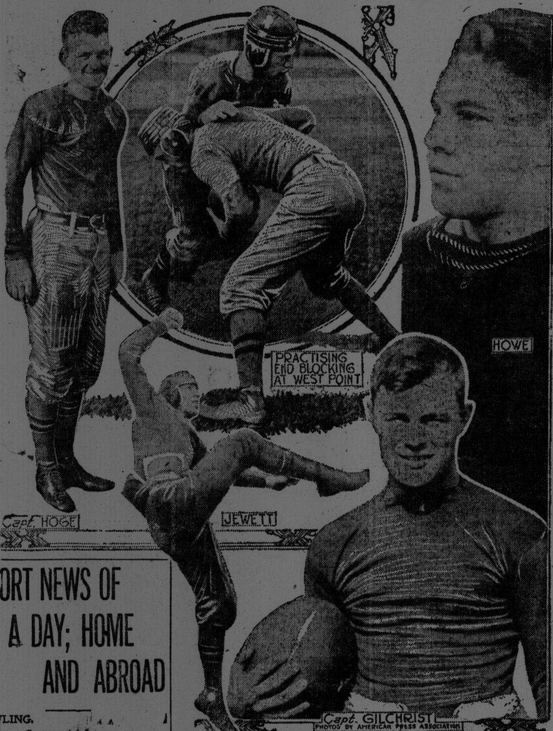
PORT NEWS OF A DAY; HOME AND ABROAD