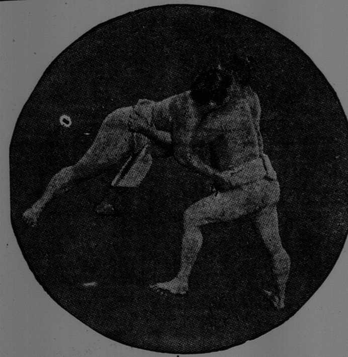
A couple of the "powerful Katsinkas" doing their artistic stuff.

Giant Grapplers With Billowy Waistlines Are Idolized by Wrestling Fans.