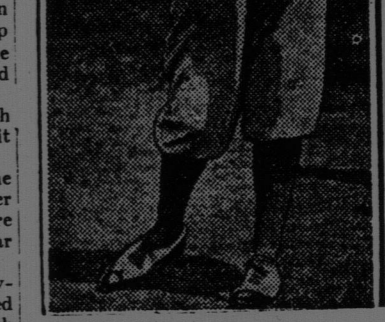
This picture of Walter Hagen, winner of the British open golf championship, was taken as he played at Hoylake and is the latest picture of him. He is the first American to win the British championship.

Much Interest Being Manifested in Riverside Club Premier Award.