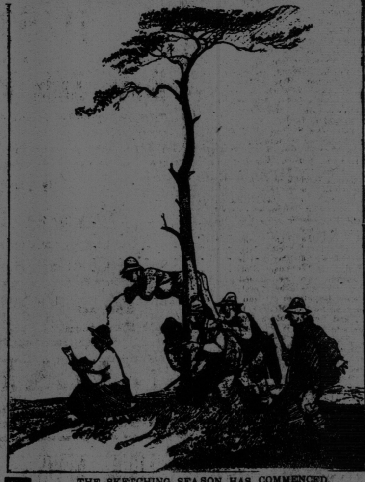
THE SKETCHING SEASON HAS COMMENCED. A Suspected Spy.