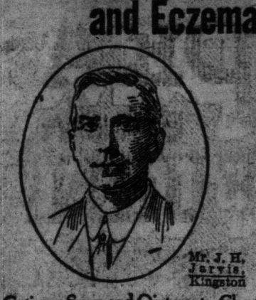
By Cuticura Soap and Ointment. Chest

High Speed in Bay Is Dangerous to Small Craft and